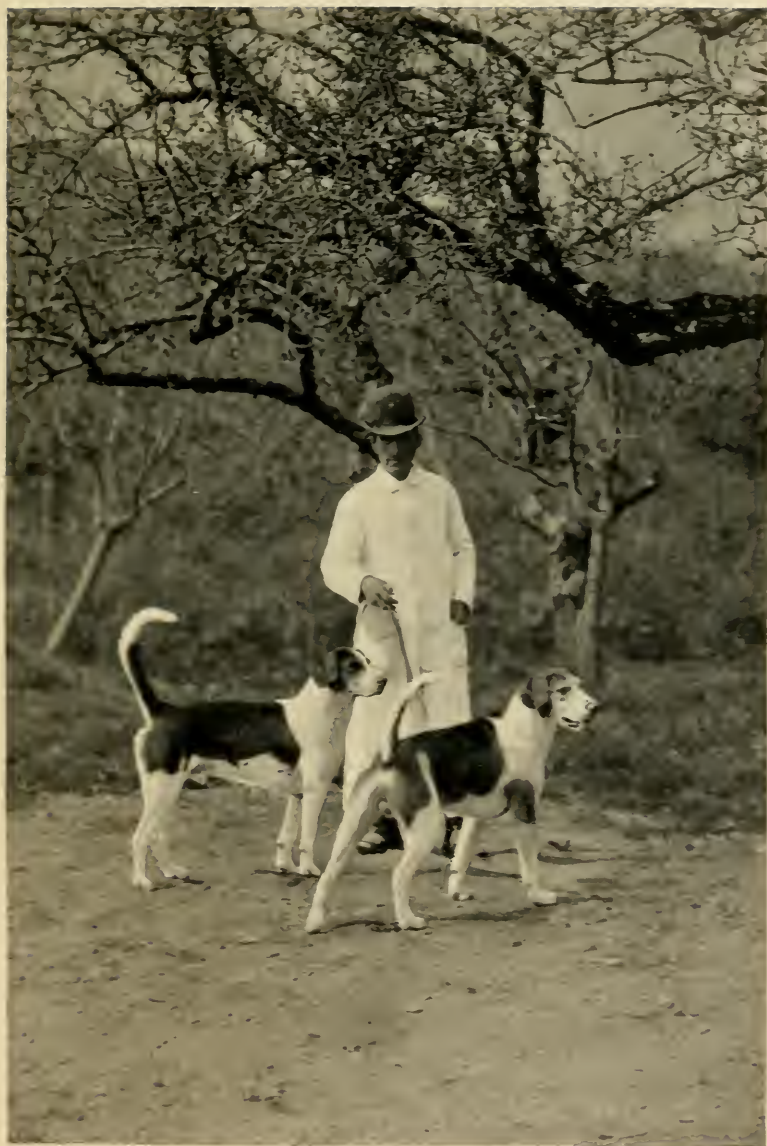
COLLINGS WITH HARBINGER AND STRIPLING